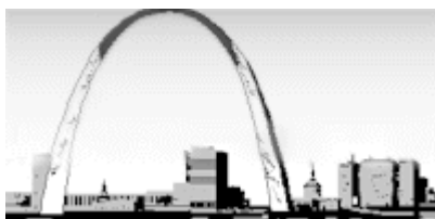
End User's in the St. Louis Area

SimplexGrinnell will be hosting our meeting on " The Latest Fire Protection Technology " including interface with fire protection devices. Discussion will also include testing requirements and procedures for equipment discussed.