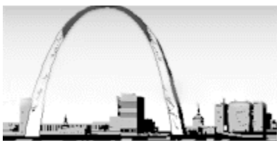
End User's in the St. Louis Area

C&R Mechanical Company will be hosting our meeting on "Protecting Buildings and Their Occupants From Airborne Hazards".